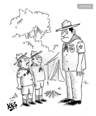
"Yes, I do know how to light a fire with two sticks... Provided one of them is a match."

Want to say thanks to a volunteer – you can do so online and the volunteer will receive a special recognition. It's easy – just go to this website and fill out the information. You do need to know their real name – not just their leader name and if not sure ask them or another volunteer or parent. <a href="https://www.scouts.ca/thanks">www.scouts.ca/thanks</a>