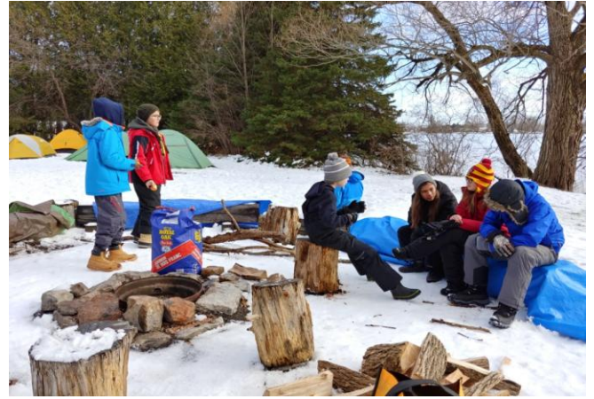
On Saturday, they worked on outdoor skills and earning their axe/saw and stove/lantern permits.