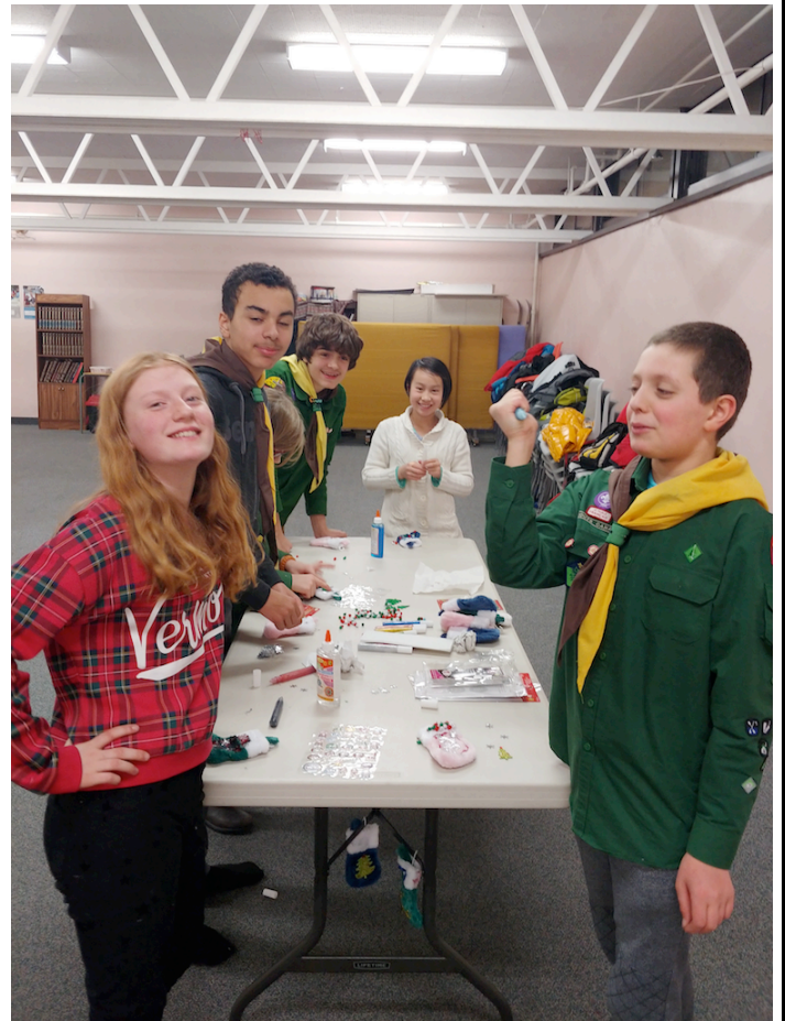
The Scout Leaders look forward to more adventures in winter and crossing their fingers for lots of snow for winter camp.

The Scouts ended the month with a Christmas/Holiday party with lots of food. And if there anything Scouts know and love to do, it's eat and eat and eat some more.