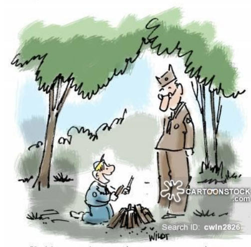
"Rubbing sticks together was a great idea. After 40 minutes, I'm so warm I don't need a fire!"