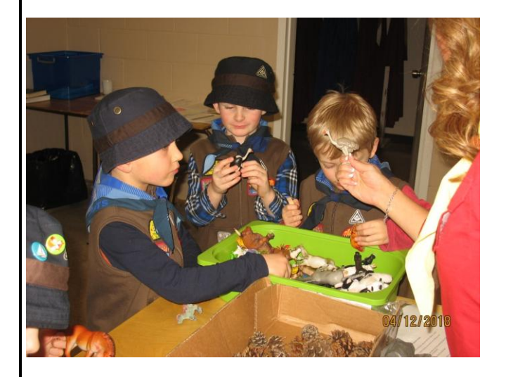
And stories of its own.

While the Beavers only had three meetings in December, they were still jam-packed with lots of cool activities. First, they wrapped up their cultural nights with a focus on creating a country of their imagination. Complete with nature.