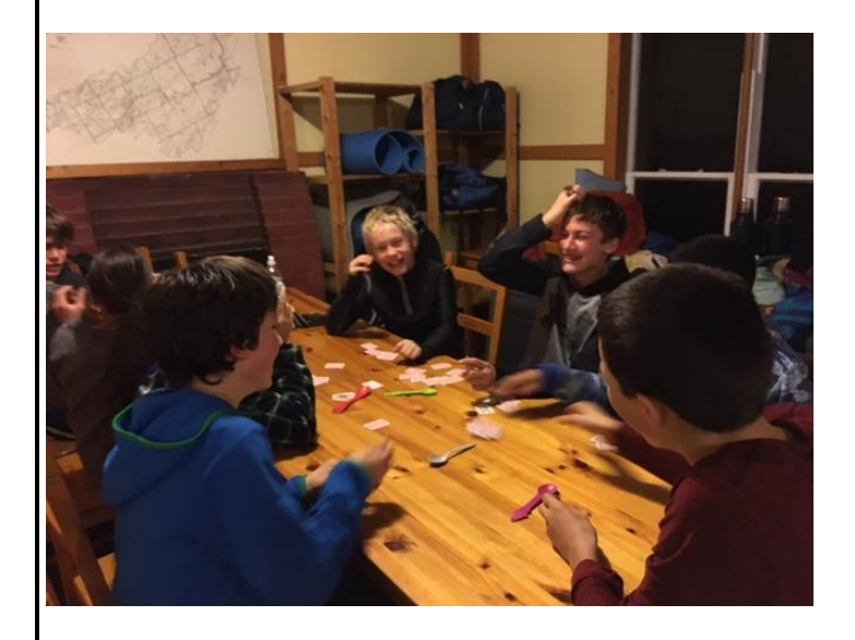
Easier to play games with a table.